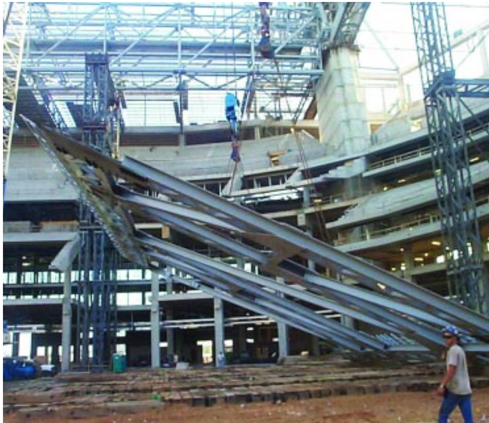
A 400-ton crane and a 650-ton crane perform a tandem lift of a fabricated side section of the east supertruss. The scoreboard box truss (still supported on erection towers) can be seen framing into the left side of the concrete supercolumn.