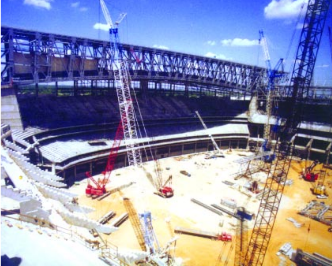
The erection towers have been removed from beneath the west supertruss. The lacing of the truss chords and vertical web members are visible in this picture. The first fabric panels have been installed on the left end of the main truss span.